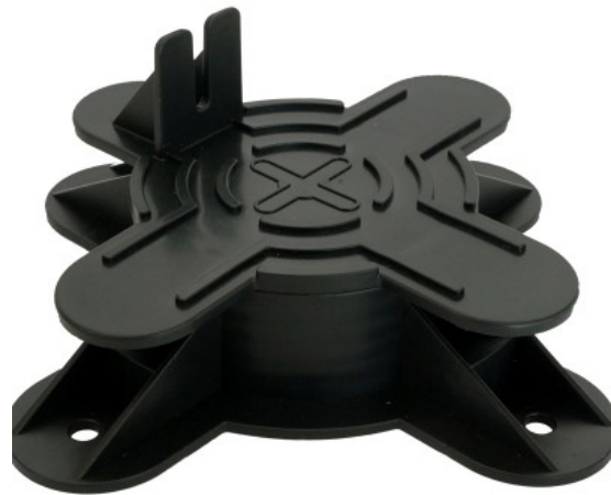
Adjustable deck pedestal