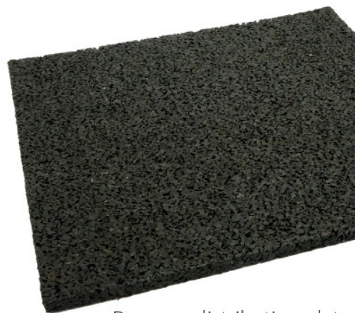
Pressure distribution plate

www.silvatimber.co.uk | enquiries@silvatimber.co.uk | 0151 495 3111 | 020 8150 8055